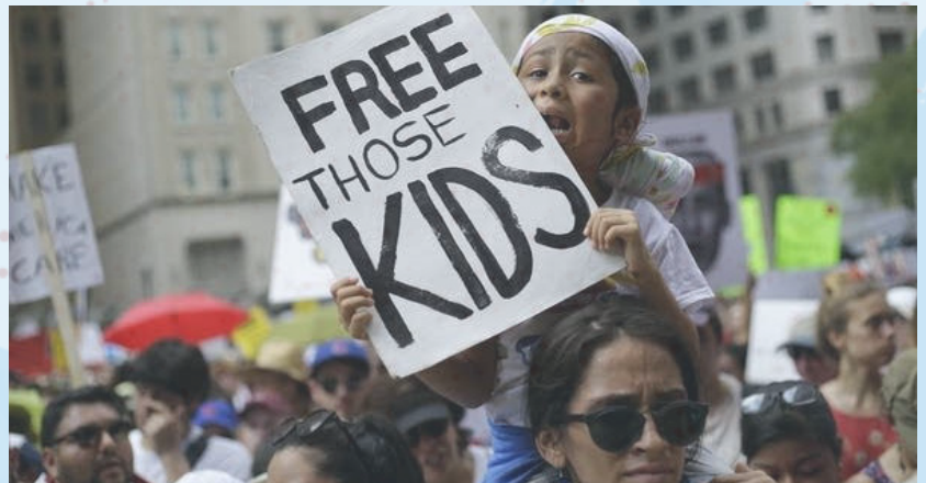
Demonstrations nationwide and a federal judge's order led the Trump administration to back down from its zero tolerance border policy, but the government has missed a deadline to reunite families.