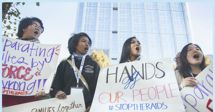
Demonstrators protest the detentions and deportations of Cambodian Americans in front of the Immigration and Customs Enforcement (ICE) office in Sacramento, Calif., on Oct. 3, 2019.